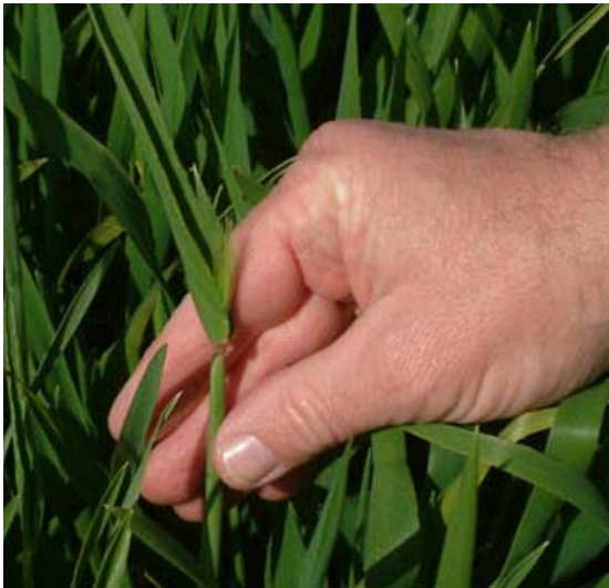
Proven inputs could be key to protecting barley profit

Maximising yield of feed barley crops and quality of malting crops, with cost-effective inputs, will help boost barley profitability. We look at agronomic advice.